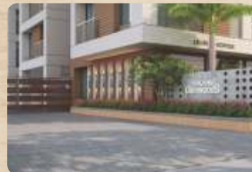
Automatic Entrance Gate