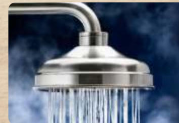
24 hrs Hot Water in all Baths