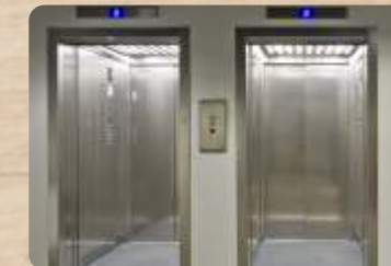
2 Elevators in each tower