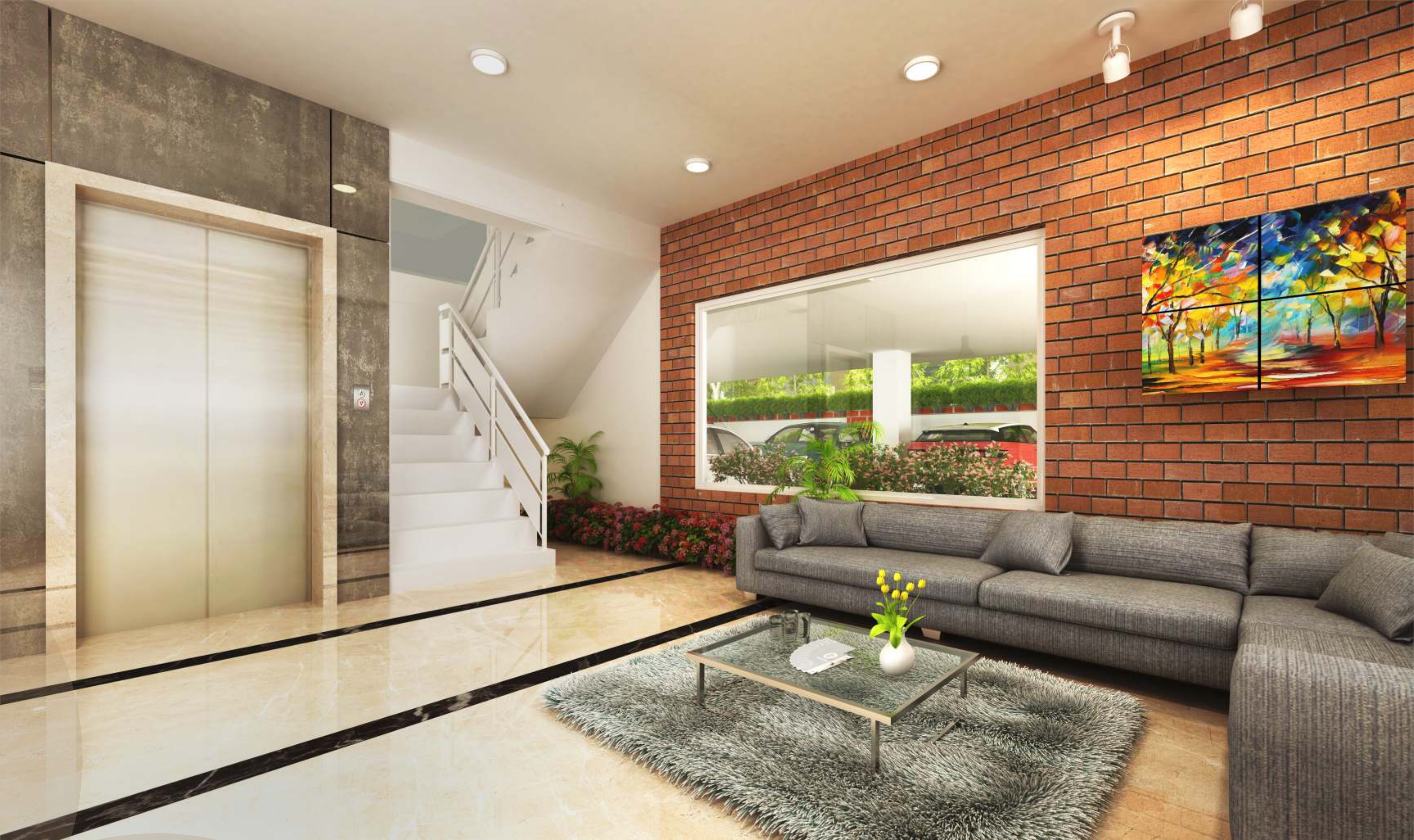
Foyer with Meeting area