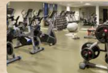
Covered AC Gym