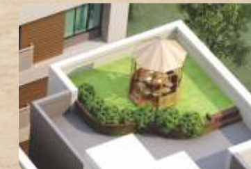
Terrace Garden Sit-out with Gazebo